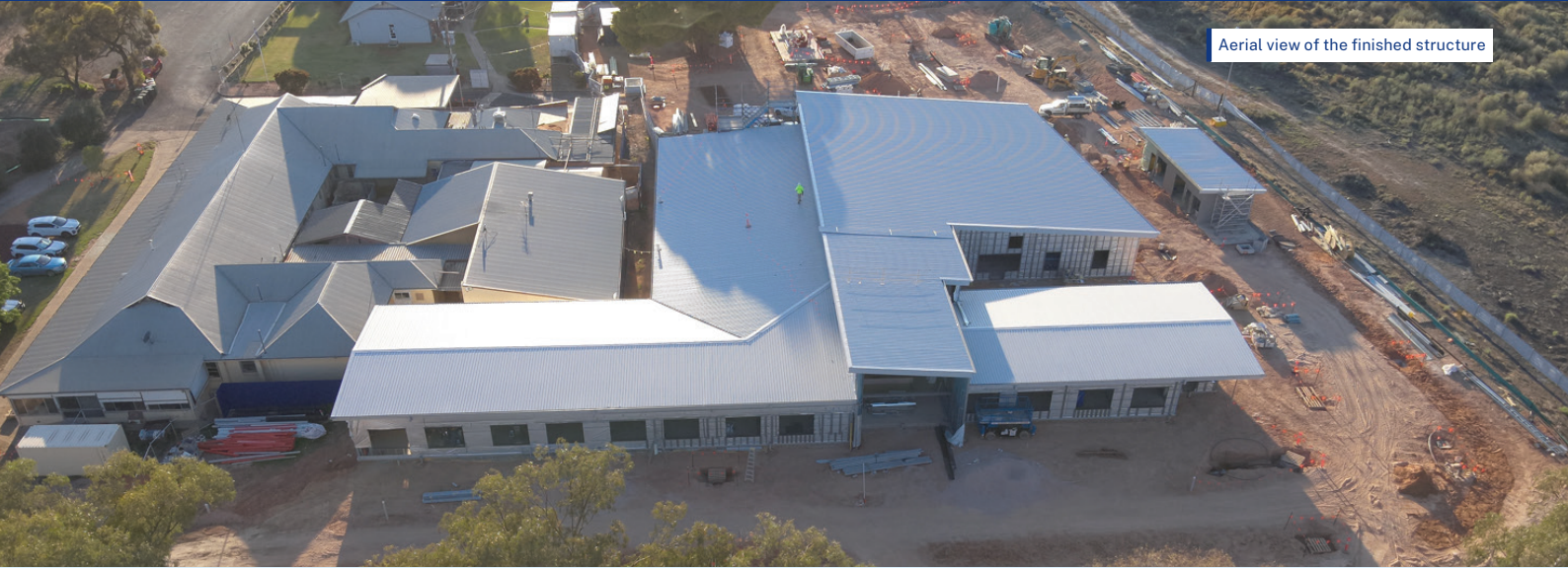
Aerial view of the finished structure